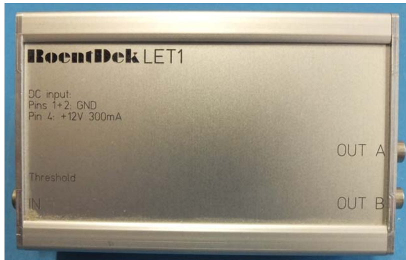
Figure: LET1 module. The LET1+version is similar but biased via an USB socket (see below)

The RoentDek LET1+ is a single channel leading-edge discriminator with internal amplifying stage for simple and convenient read-out of signals from timing/counting devices like the RoentDek DET detectors and similar MCP-based detectors, or generally for any type of fast avalanche counter like channeltrons, photo-multipliers, -diodes or even gas-filled detectors. After adjusting a threshold level via a potentiometer for discriminating against electronic noise, the LET1+ will produce a “logic” signal (usually of NIM-level) for every detected particle (or photon). The output signal width is fixed, but can be varied with a second potentiometer. This signal can be used as input for a counter or trigger device. Optionally the unit can be supplied with one TTL output (at position of OUT B in figure below) and/or one output of variable length (NIM only, at position of OUT A in figure below), corresponding to the time over threshold (ToT). Information on the arrival time is presumed with a precision on the order of signal rise time (typically 1 to 5 ns FWHM temporal resolution when used with a RoentDek DET detector). The ToT can give information about the input pulse height.