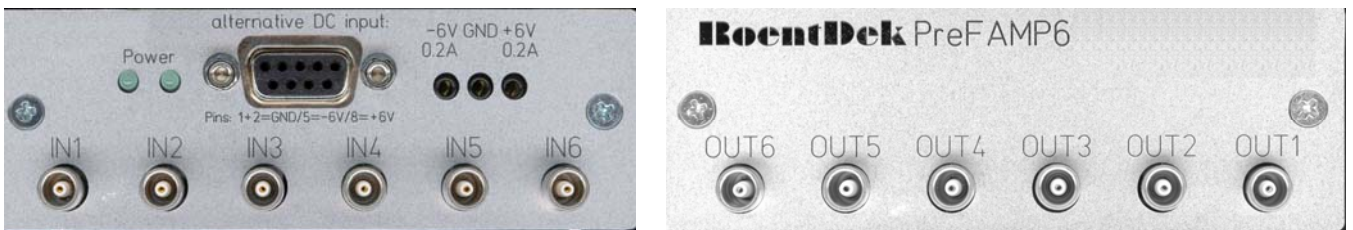
Figure 3: rear panel of PreFAMP6 (left) with signal inputs and DC power input via 9-pin sub-D connector or 2mm pins. Right: front panel of PreFAMP6 with signal outputs.

The PreFAMP6 case is a stand-alone box with size 115 mm x 40 mm x 105 mm, weight 300g and needs an external power input of +/-6V (0.2 A) via front panel inputs, e.g. from the SPS1b .*